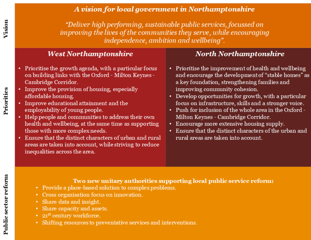
Figure 4: Emerging vision and priorities for the new unitary authorities in Northamptonshire

5.1. The Best Value report’s reference to a ‘new start’ for the residents of Northamptonshire is couched in terms of needing to deliver ‘confidence and quality in the full range of local government services’. The Northamptonshire councils are developing a vision for the future of local government in the county, with emerging emphases for the West and North areas, as shown in the diagram below: